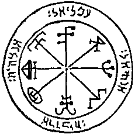
Third Pentacle of Saturn

(From The Keys of Solomon, Mathers 1974)